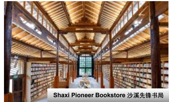
Shaxi Pioneer Bookstore 沙溪先锋书局