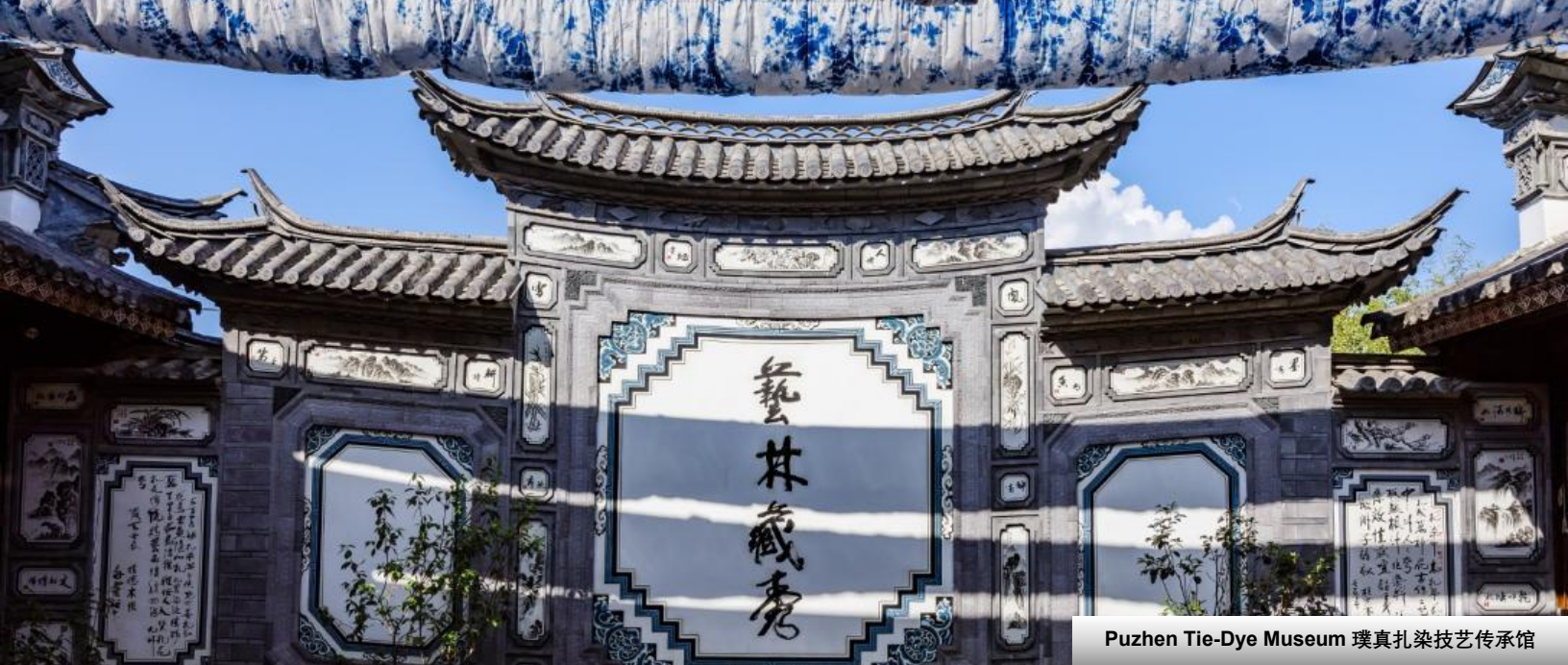
Puzhen Tie-Dye Museum 璞真扎染技艺传承馆