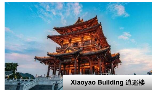
Xiaoyao Building 逍遥楼