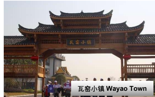
瓦窑小镇 Wayao Town