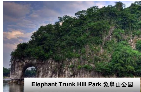
Elephant Trunk Hill Park 象鼻山公园