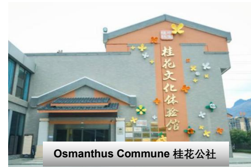
Osmanthus Commune 桂花公社

*Image shown are for illustration purposes only*