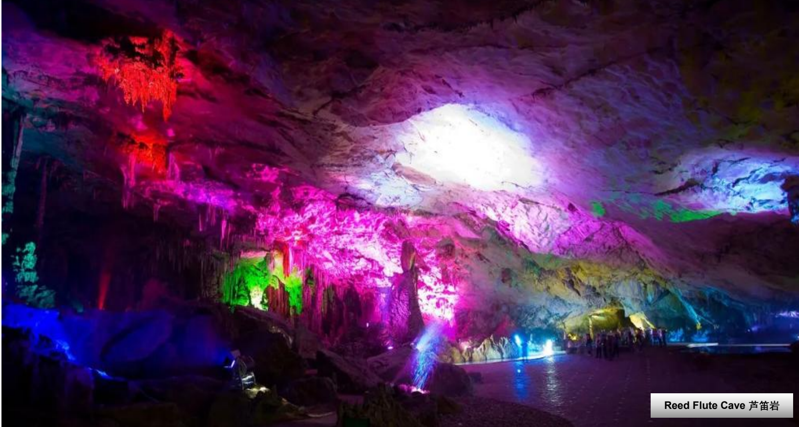
Reed Flute Cave 芦笛岩