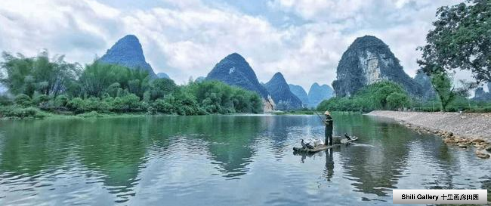
Shili Gallery 十里画廊田园