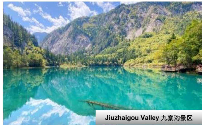
Jiuzhaigou Valley 九寨沟景区