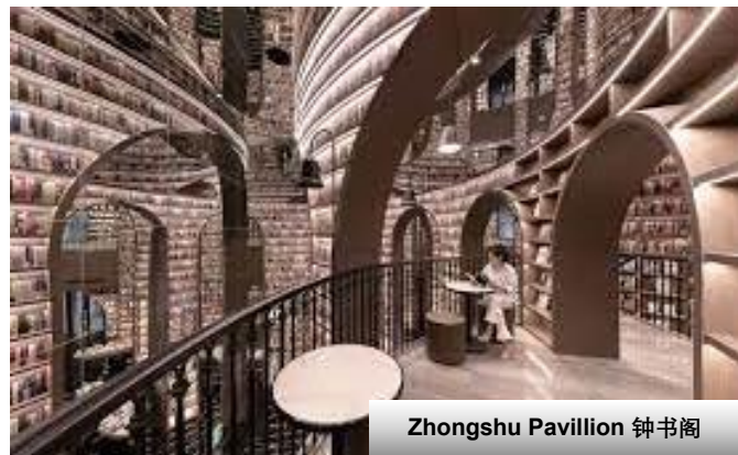
Zhongshu Pavillion 钟书阁