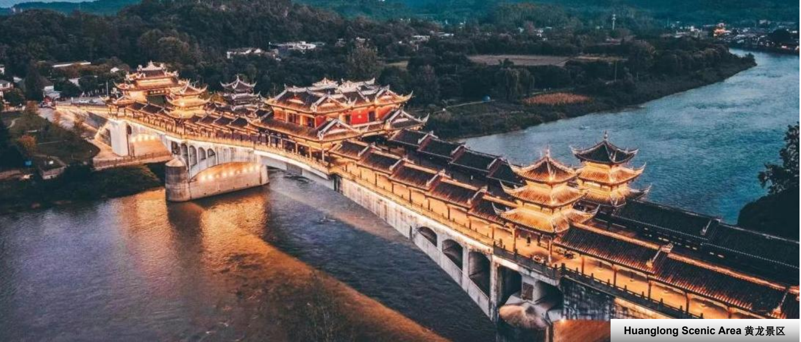
Huanglong Scenic Area 黄龙景区