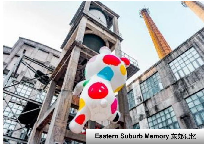
Eastern Suburb Memory 东郊记忆